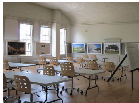
Sherburne Hall - Exterior and Interior Views

Participants are housed in a University of Florida-owned dormitory located a twenty-minute walk from the academic studio. Wireless DSL is also provided in the dormitories. Housing costs for the program are included in the fee.