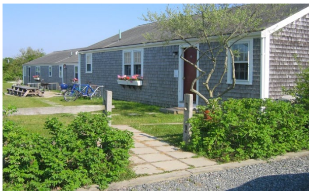
University of Florida Dormitories on Nantucket

Participants are housed in a University of Florida-owned dormitory located a twenty-minute walk from the academic studio. Wireless DSL is also provided in the dormitories. Housing costs for the program are included in the fee.