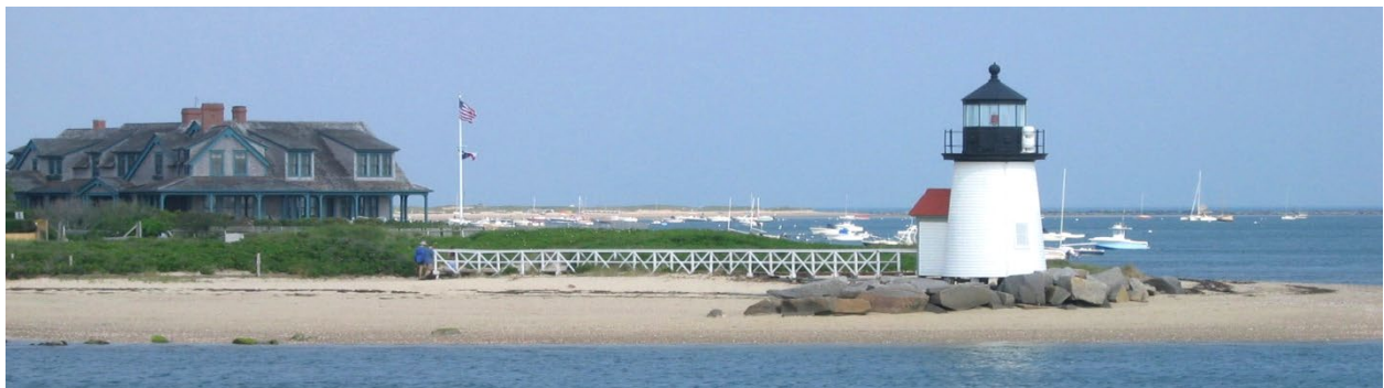
Brant Point Lighthouse (1900) was documented by participants in the Preservation Institute Nantucket in 1998.

This beautiful, but fragile island with its long history of innovative community and private sector preservation initiatives is a living laboratory to study preservation of the cultural landscape and the historic built environment. PIN has been a part of this ongoing process for over four decades, documenting many historic structures, researching issues of public concern and interest, and providing forums for community education and discussion.